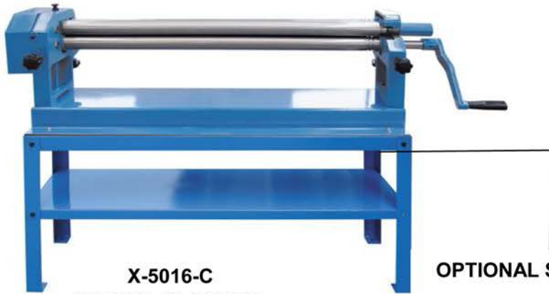
X-5016-C MANUAL SLIP ROLL