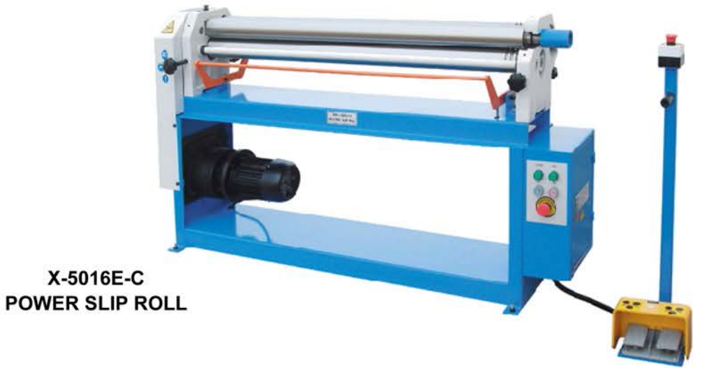
X-5016E-C POWER SLIP ROLL